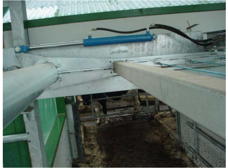
The hydraulic ram lifts and lowers the backing gate