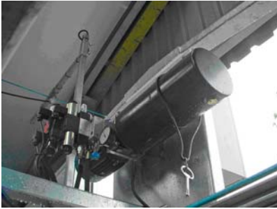
The hydraulic unit